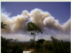
The smoke billows past our back verandah.