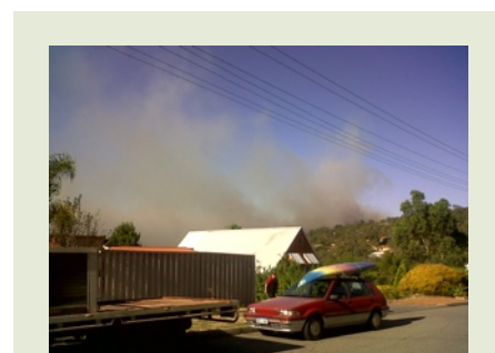
Smoke over the hill opposite our home.