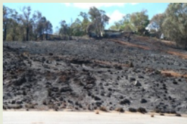
Just some of the aftermath of the Feb 6 fires.